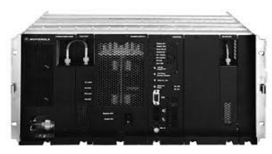
Figure 1 -Motorola Quantar

The Quantar is a workhorse repeater, available in VHF, UHF, and 900 MHz versions usable on the amateur bands. Power outputs range from 25 watts to 350 watts in the similar Quantro. The Quantar was never intended for wide area, multipoint linking, but this is exactly what was needed for Amateur Radio use.